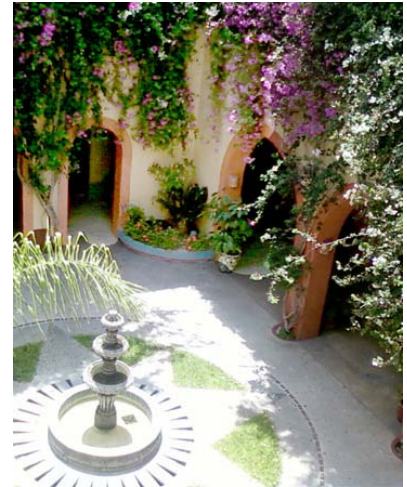
The courtyard of the Melville Hotel