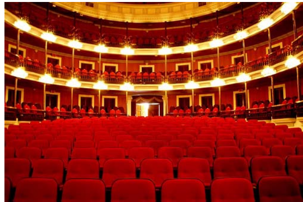
Teatro Angela Peralta

The Institute will be based in Mazatlán’s restored opera house, the Teatro Angela Peralta, which sits on the Plaza Machada in El Centro Histórico. The neighborhood is full of lovely galleries, restaurants, hip night spots, and quirky boutiques. You will be able to stroll the plaza and the surrounding narrow streets and alleys—the downtown is lively, charming and completely safe. In addition, we have planned two excursions to expand your experience Mazatlán (con comida, cerveza y Tequila, claro).