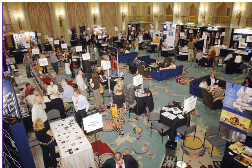
Exhibits in the Millennium Biltmore Hotel's Crystal Ballroom, August 2007. The Commons, WAA's new exhibit hall, has 221 exhibitors. This is the first conference in more than 15 years where exhibits are located in the host hotel.